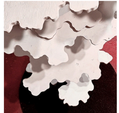
Stacy Latt Savage